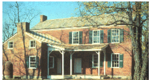
Conner Home, built in 1823